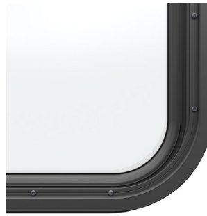
Clampring without fastener cover

AROW Global framed transit window products are installed via the industry-standard clampring method where the window is inserted into the bus opening from the exterior, and a mating clampring positioned from the interior and attached to the window via threaded fasteners. The Evolution window design includes an option to specify a clampring equipped to house a cover channel to hide fasteners from view.