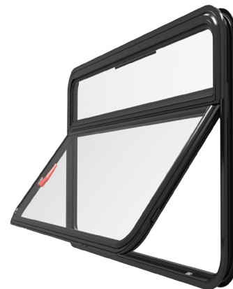
Evolution Series Tip-in Egress Window Hinged at horizontal transom resulting in egress opening that is approx. 70% of total window opening.