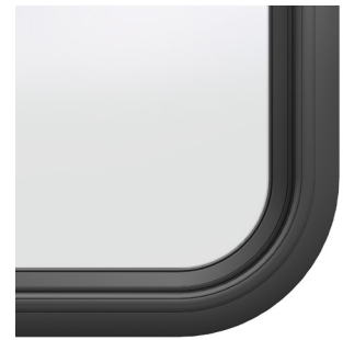
Clampring with fastener cover