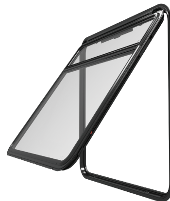
Obsolete Rapid Replacement Series Tip-in Egress Window Hinged at top of window resulting in egress opening that is 100% of window opening.