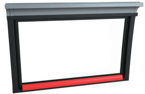
Full Fixed Configuration w/ Egress Release at Sill (Interior view)