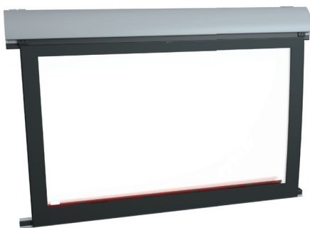
Full Fixed (Exterior view)