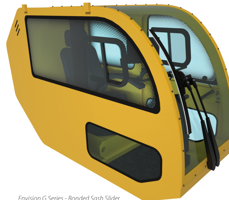
Envision G Series - Bonded Sash Slider